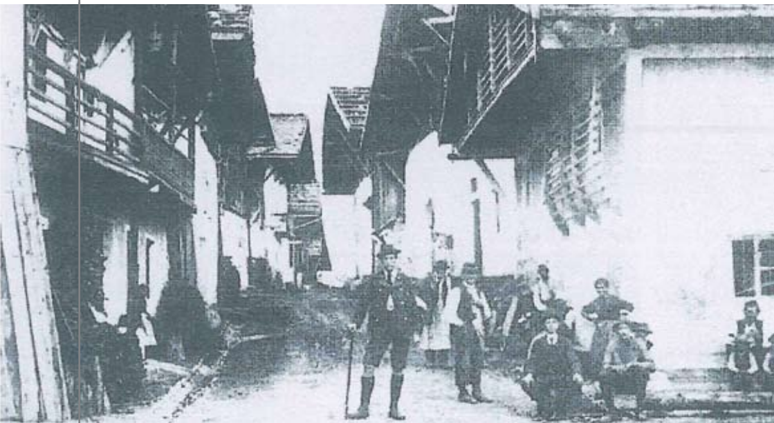
Reith Anno 1878