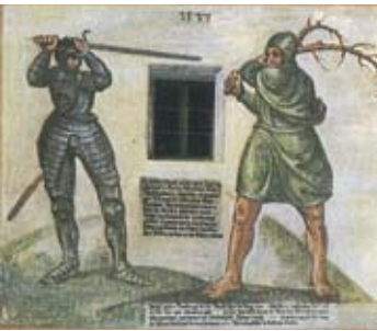
Painting on House of the Giant

Right at the upper border between Zirl and Leithen, a votive shrine with a beautiful carved statue of Our Lady stood for centuries. After 1900, the wood of the shrine began to deteriorate, so the young farmers from Leithen erected the plaster columns which can be seen today. It is said that someone tried to examine the carved statue with a knife and blood began to flow from the wood, so he immediately stopped. The Madonna and Child statue was stolen in 1972.